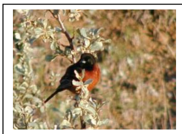
Orchard Oriole