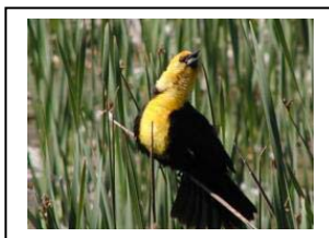
Yellow-headed Blackbird

ABOUT THE TOUR – This tour is designed for birders looking for a wide variety of local birds and other indigenous creatures. Along with other nearby destinations, the tour will venture to Arrowwood National Wildlife Refuge , which is located along the James River in east-central North Dakota. The refuge is 15,934 acres in size and made up of lakes, marshes, prairie grasslands, wooded coulees, and cultivated fields. Along with other native wildlife, we anticipate that birders will get a good look at a local bison herd from a ranch adjacent to the refuge which often grazes the property. As for bird species, the shallow wetland areas of the refuge often produce Willow Flycatchers and Marsh and Sedge wrens. Deeper wetlands often harbor Great Blue Herons, Great Egrets, American Bitterns, Black-crowned Night-Herons, and Hooded Mergansers. In grassland areas, look for Upland Sandpipers, Sedge Wrens, and Bobolinks. Other frequently seen species include Savannah, Grasshopper, and Clay-colored sparrows. Dickcissels, Le Conte's and Nelson's Sharp-tailed sparrows are not common, and can be seen on occasion. A variety of breeding waterfowl and upland game birds can also be seen.