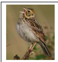
Baird's Sparrow

ABOUT THE TOUR – Here is another opportunity for birders to add to their life lists. Guided by experts, birders will explore the Horsehead Lake area for more of the state's specialty birds, and will discover much more. Horsehead Lake is located in Kidder County, which is known as one of North Dakota's hottest birding spots. This is a premier example of the famous Prairie Pothole Region, especially the glacial outwash area which is teeming with an extreme diversity of breeding grassland and wetland bird species. Birders will have the chance to see American Bitterns, Franklin's Gulls, Yellow and Virginia rails, Sedge and Marsh wrens, and Le Conte's and Nelson's Sharp-tailed sparrows. Drier prairie sites might offer sightings of Ferruginous Hawks, Chestnut-collared Longspurs, Vesper, Savannah and Grasshopper sparrows, as well as one of the area's most sought after species, the Baird's Sparrow.