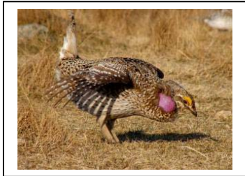
Sharp-tailed Grouse

ABOUT THE TOUR – This tour is designed for birders looking for a wide variety of local birds found on the glacial drift plain that covers much of North Dakota. Habitats that will be visited include riparian woodlands, shelterbelts, native prairie, conservation plots, and a variety of wetlands. Lake Juanita, the Sheyenne River, the James River and North Dakota State School Land are all potential points of interest. The tour may also include Arrowwood National Wildlife Refuge , which is located along the James River in east-central North Dakota. Shallow wetland areas will be searched for Willow Flycatchers and Marsh and Sedge Wrens. Deeper wetlands often harbor Great Blue Herons, Great Egrets, American Bitterns, Black-crowned Night-Herons, and Hooded Mergansers. In grassland areas, we will look for Sharp-tailed Grouse, Gray Partridge, Upland Sandpipers, Sedge Wrens, and Bobolinks. Other frequently seen species include Savannah, Grasshopper, and Clay-colored Sparrows. Dickcissels, Le Conte's and Nelson's Sharp-tailed sparrows are not common, but can be seen on occasion. A variety of breeding waterfowl and upland game birds will also be seen.