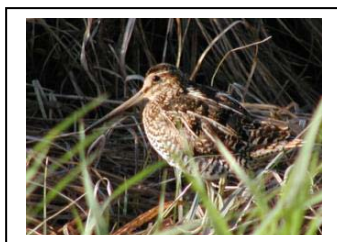
Common Snipe