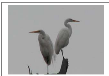
Great Egrets

For those in search of some of North Dakota's specialty birds like the Baird's Sparrow, don't miss this tour. The guided tour to Chase Lake National Wildlife Refuge will take birders through rolling hills of the Missouri Coteau region . The mixed-grass prairie and agricultural land here is dotted with thousands of prairie wetlands of various sizes and permanency. This area provides a diverse blend of habitats that support a wide array of bird species. The highlight of this tour is the refuge itself, home to North America's largest American White Pelican nesting colony. Also, several hundred Double-crested Cormorants, Ring-billed and California gulls, and a few Caspian Terns typically nest here. Other common bird sightings might include Western, Clark's and Eared grebes, Cattle and Snowy egrets, Franklin's Gulls, Forster's Terns, and a wide variety of duck species. Birders will also have the opportunity to hear or see Virginia Rails, Soras, Marsh and Sedge wrens, and Swamp, LeConte's, and Nelson's Sharp-tailed sparrows. The popular Baird's Sparrow, along with Sprague's Pipits, and Chestnut-collared Longspurs are also usually present. Swainson's Hawks and Loggerhead Shrikes can be common sightings in tree rows.