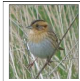
LeConte's Sparrow