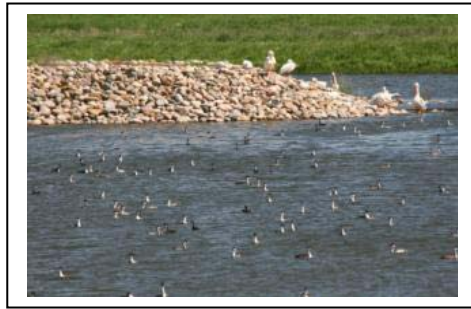
Pelicans