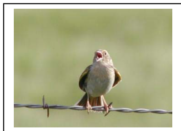
Grasshopper Sparrow

Dakota's special species such as Sprague's pipit and Baird's sparrow. If you love Big Day birding, or you'd like to give a Big Day a try, this is the trip for you. Prepare to have fun! No wussies allowed!