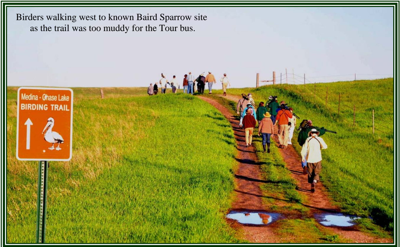
Birders walking west to known Baird Sparrow site as the trail was too muddy for the Tour bus.